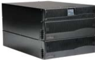
Powerware 9125 6000 VA