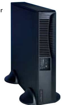
Powerware 9125 3000 VA