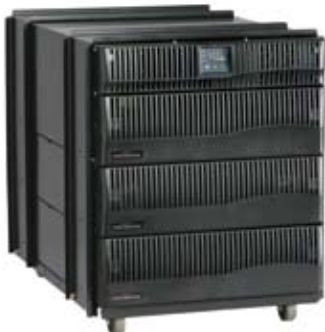
Powerware 9125 6000 VA with 2 EBMs

LanSafe® power management software enables independent control of load segments, which are groups of receptacles on the rear panel of the Powerware 9125 UPS (700-3000 VA). This feature allows